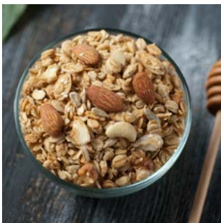
NUTTY HONEY GRANOLA™

Enjoy by the bowlful, handful, or as a topping.