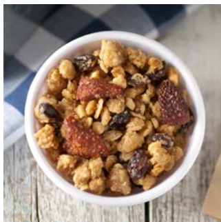
PB & J GRANOLA