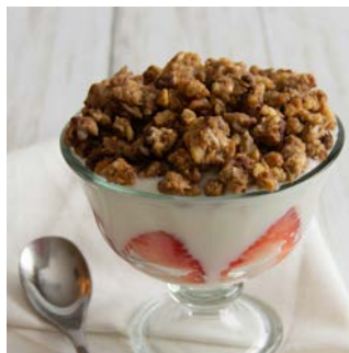
GRAIN FREE CHOCOLATE COCONUT GRANOLA

Each variety is created with superior ingredients to deliver quality and freshness that you can taste! Bakers combine hearty rolled oats, select nuts, plump dried fruits and less-refined sweeteners including agave, cane juice and honey to create each blend. We bake our granolas in small batches to maintain the highest quality and consistency, and pack them fresh-to-order.