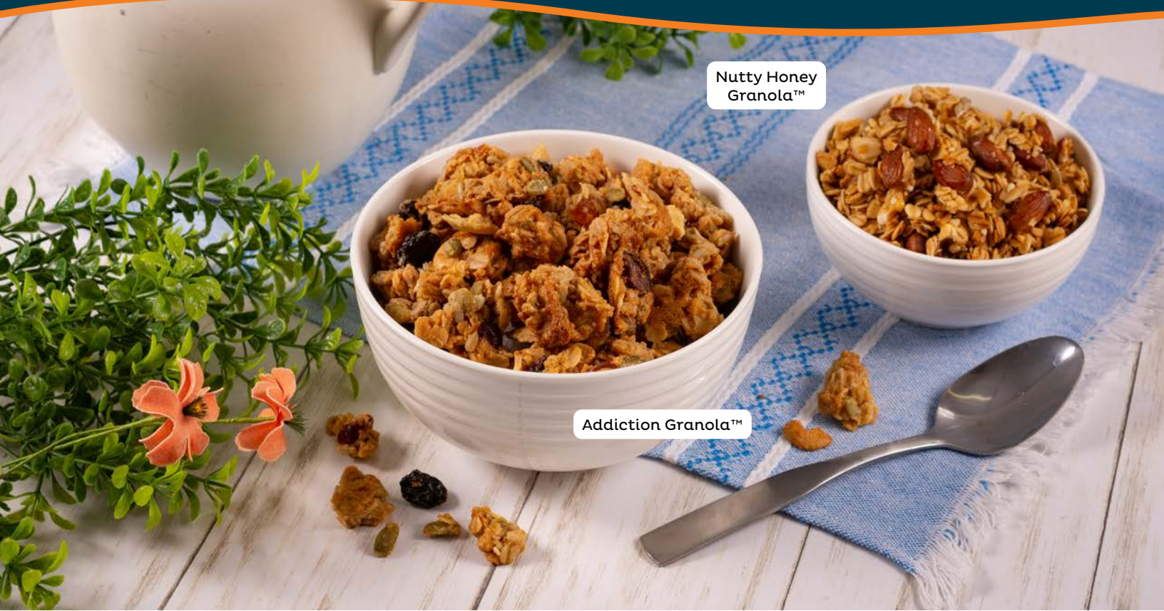
Nutty Honey Granola™